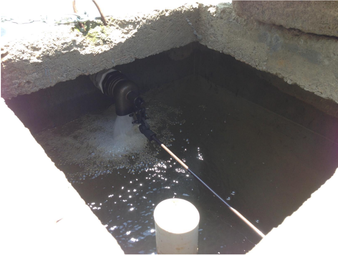
Inside the pressure break tank.