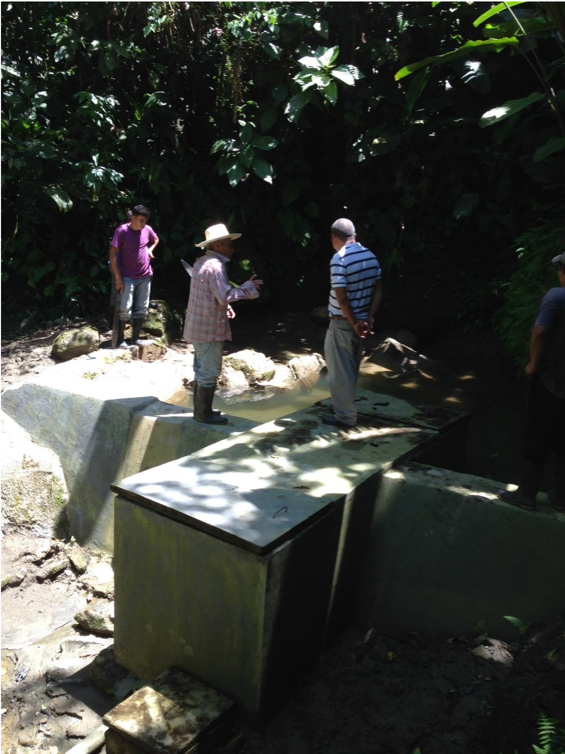
Las Palmas dam. The grouted fissure is between the two men in the foreground, at the waterline.