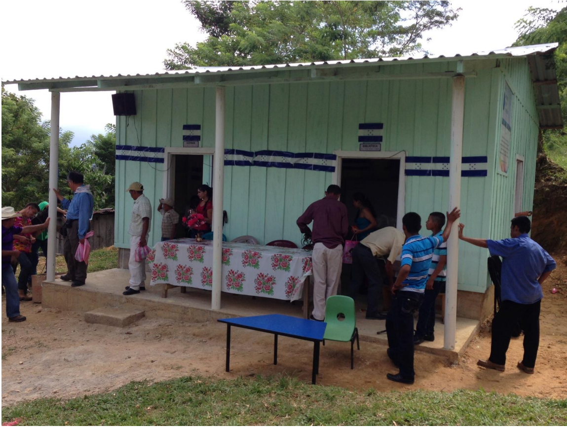
Monte Vista kindergarten (left door) and library (right door).