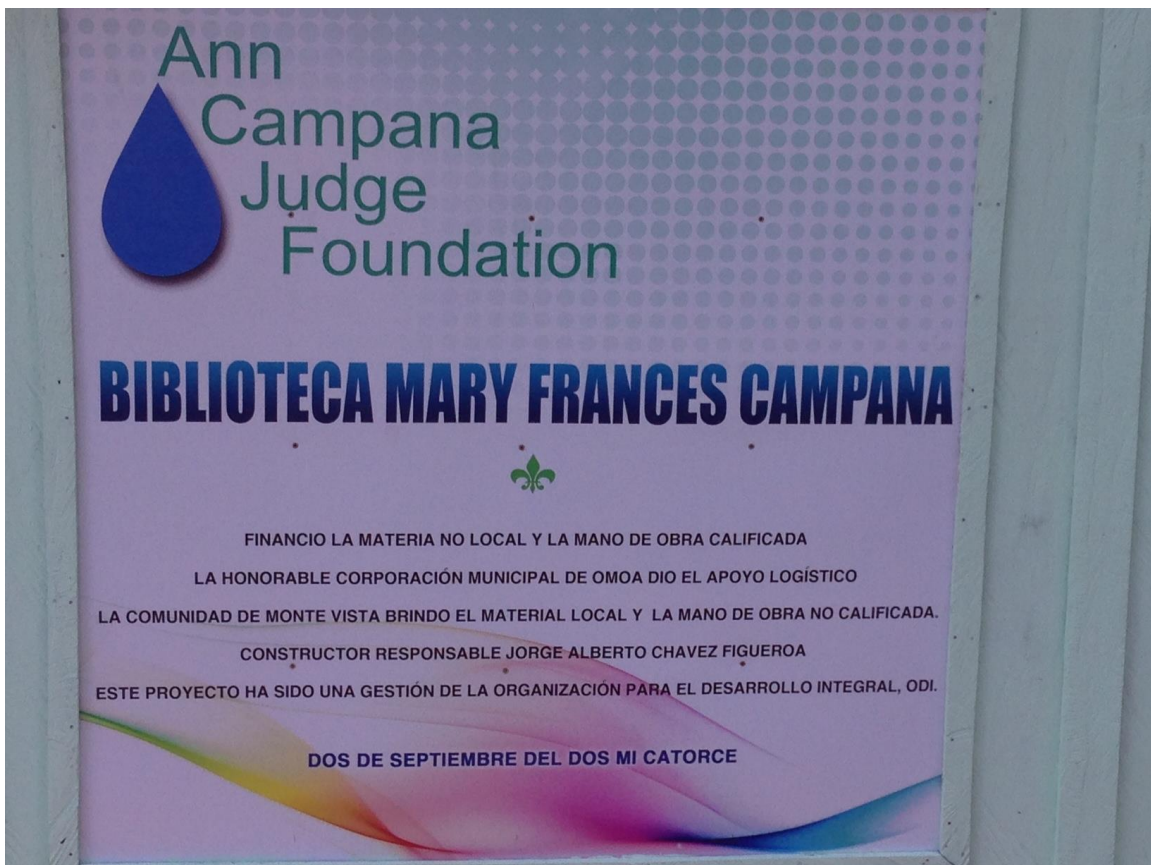
Library signs – front door and side of building.